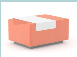
Metal table placed on the pouf (black or white colour)